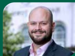
Philip Glanville, Mayor of Hackney